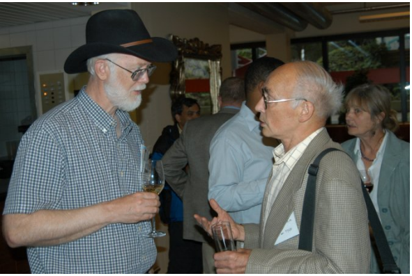
Nordstrom & Kolonin